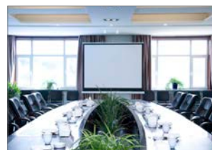
Conference & Lecture rooms