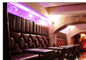
PA for restaurants