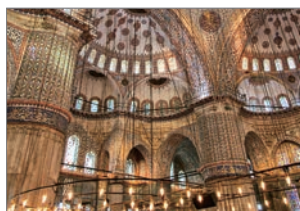
Mosque with reverb effect