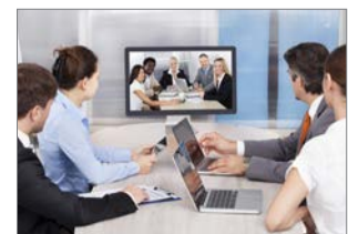
Video conference rooms